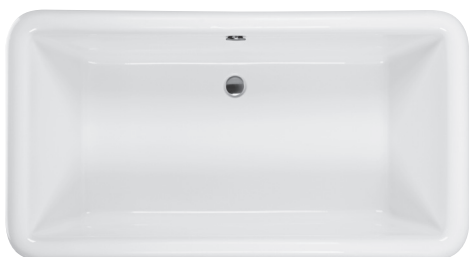
Inside view of tub.