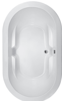
Inside view of tub with optional armrests.