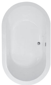
Inside view of tub.