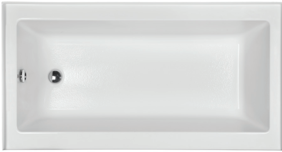
Features integral front skirting & tile flange on 3 sides.