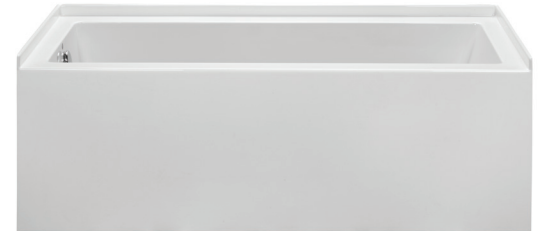
Front view of tub with non-removable front panel