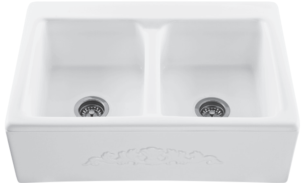
Available with plain or embossed apron at no charge. Please specify when ordering.