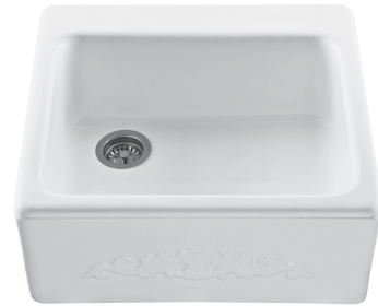
Available with plain or embossed apron at no charge. Please specify when ordering.