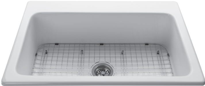
Optional sink grid shown above.

NOTES: Measurements are ±1/2" and are subject to change without notice. Data herein supersedes all previous prior to publication date indicated below.