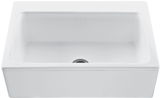
Available with plain or embossed apron at no charge. Please specify when ordering.