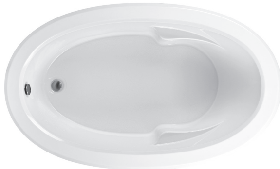
Features integral armrests.