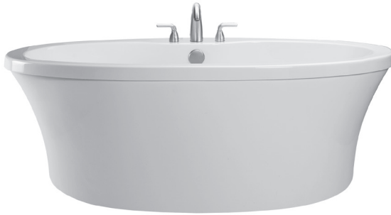
Shown with a deck-mounted faucet. Faucet is not included with tub.