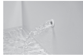
Virtual Spout integrated high-flow tub filler. See 'packages and options' below.