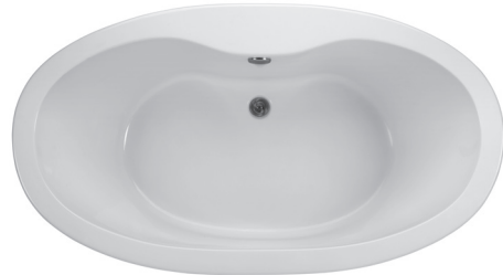
inside view of tub

NOTE: Filling this tub to the maximum may require an above average size or dedicated water heater.