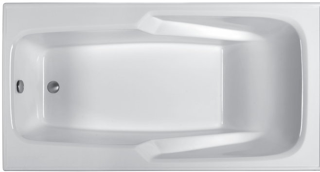
Features integral armrests.