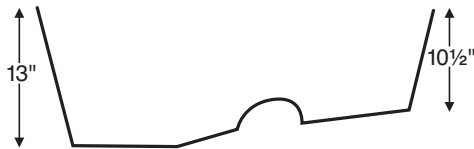
Side view of bottom of spa.

Before ordering or installing, please consider future access to equipment.