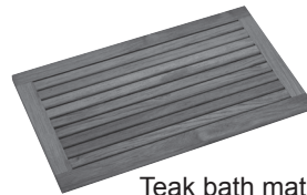
Teak bath mat

Radiance heating grids are fully integrated within the acrylic shell structure of the shower seat and floor area. Requires a 110-volt, 15 amp GFCI and remote installation of control box & keypad. For complete information, visit mtibaths.com .