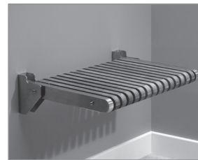
Premium teak seat Size 24" x 16"

Radiance heating grids are fully integrated within the acrylic shell structure of the shower floor. Requires a 110-volt, 15 amp GFCI and remote installation of control box & keypad. For complete information, visit mtibaths.com .