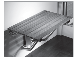
Standard teak seat Size 22" x 15"