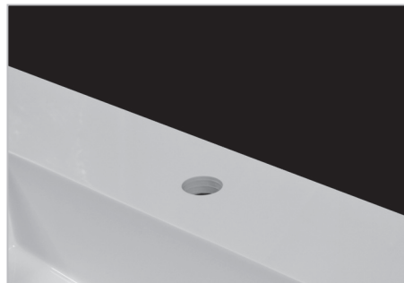
Shown above without a backsplash.

Floating Shelf is available in four lengths: 24" (small), 30" (medium), 42" (large) and 48" (extra large). Each size measures 17" deep x 3" high and is open on the bottom side to accommodate mounting hardware (included). Wall-mounted floating shelf is designed to mount below the Vanity Sink. Shelf provides storage for towels, toiletries and a variety of bathroom accessories. See ordering information below.