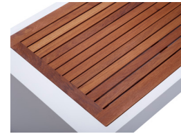
Close-up of teak insert.