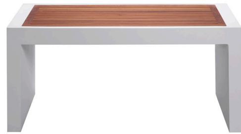
Front view of Waterfall-style bench.