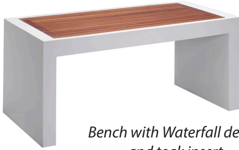
Bench with Waterfall design and teak insert.