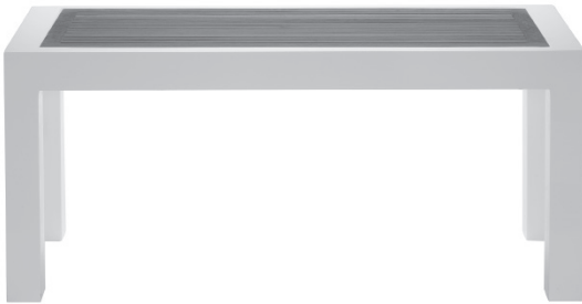
Front view of Parsons-style bench.