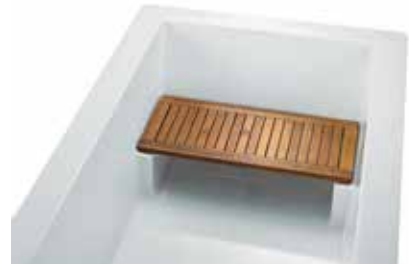
Shown with optional teak seat for use with armrests. See p. C-15 for more info.

Teak Seat for Armrests (qty. 1) (TK-REMTSEAT) $430