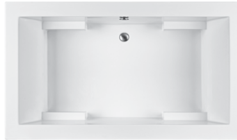
Center drain model with 2 pair of armrests.