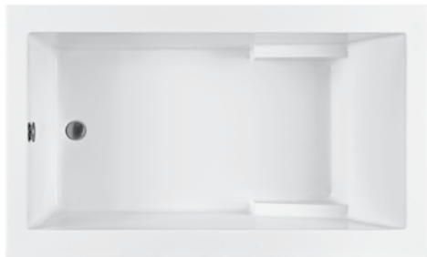
End drain with 1 pair of armrests.