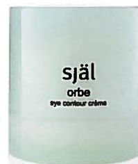
SJÄL ORBE EYE CONTOUR CRÈME, $175 FOR 5-OZ. BOTTLE, SJÄLSKINCARE.COM.

“When my sample ran out, I noticed the wrinkles were coming back. So you figure it's doing its job.”