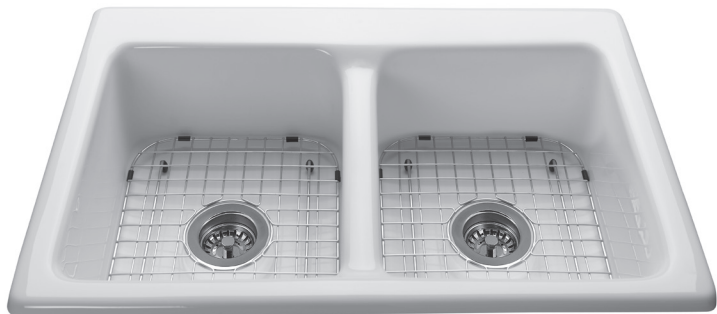
Optional sink grids shown above.

NOTES: Measurements are \pm 1/2" and are subject to change without notice. Data herein supersedes all previous prior to publication date indicated below.