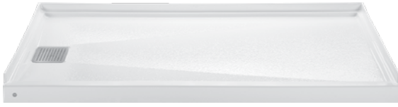
Shown with standard Stainless Steel Hidden Drain Cover.

Material - Acrylic Shipping Weight - 100 lbs / 45 kg Threshold - Low-Profile, Single Threshold Drain Location - End